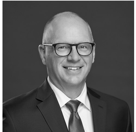
Scott Gillingham Mayor City of Winnipeg